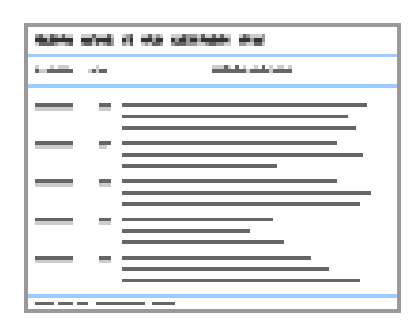
Table 1 Summary of trehalose effect on several enzymes